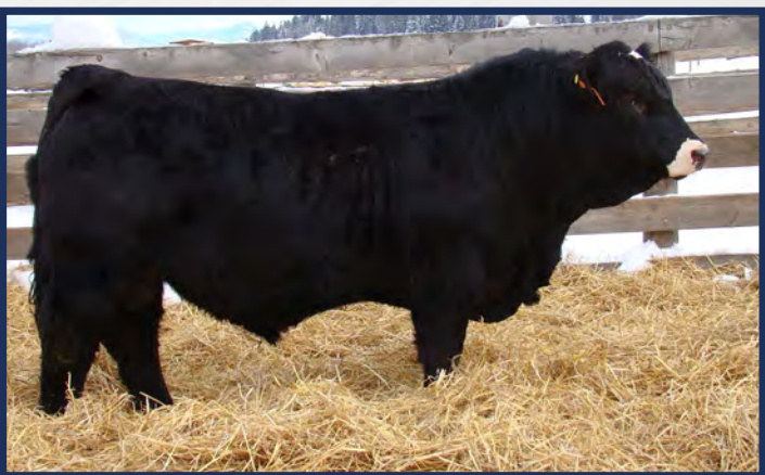
Mitchells Blk Gold 59E

"Time Out" as we call him is extremely consistent. We used him on 45 cows last year and he saw another group of cows again this spring. Not many bulls are as sound and trouble free as he is at seven years of age. It is no surprise that he is out of one of Muirhead's favourite cows, and we understand why LaBattes and Circle 7 use a brother.