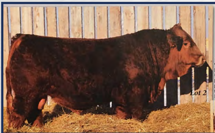
Erixon Lad 12C

A bull that we acquired out of the South Sask Sale by the popular sire Wheatland Kill Switch. His dam has a very impressive track record, bringing a bull to the sale every year. BJL 79F has added chrome and thickness, and is not a small bull himself. He is still in the top 15% of the breed for CE, BW and MCE.