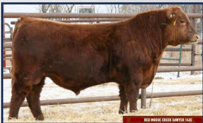
Red Moose Creek Sawyer 142E

A calving dream come true. We couldn't have asked for a better black calving ease sire in the past two years. Calves are bright and most come with that perfect white 'money stripe.' 59E has always displayed his sire's thickness and muscle throughout, and the calving ease and moderation achieved through his dam proved to be a great cross.