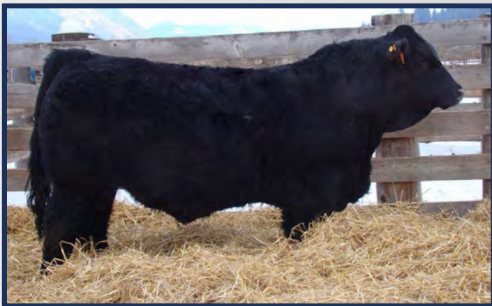
Mitchells Blk Gold 110E

110E has always been a standout and is as good as any bought bull we have ever brought West. Right from his first month up until now he has always displayed exceptional dimension and muscle pattern, as well as being extremely sound and free moving. His dam is productive and good uddered, with another calf in the sale this year and females retained in the herd. We believe you will find this set of calves to be performance oriented and built to last in the rugged conditions they were raised in, just like their sire.