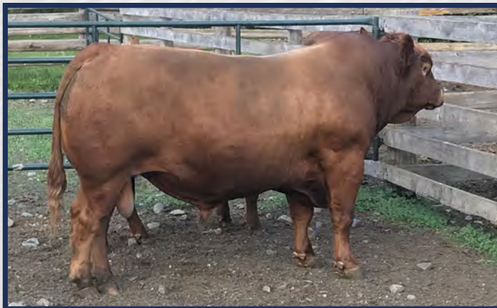
LRX Dillenger 116D