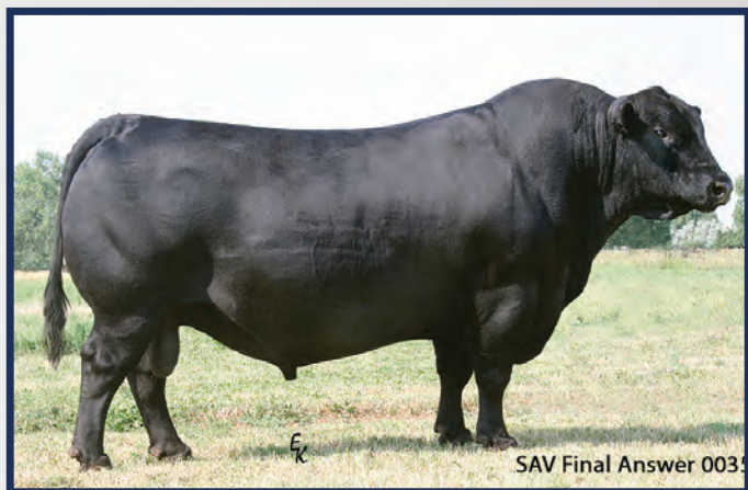
SAV Final Answer 0035