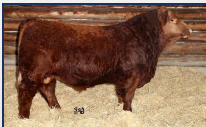
KRSS Red Desperado 4D