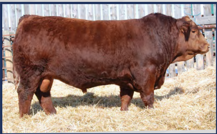
SBSF Eastwood 22E

We really like the females from our Power Play bull and decided to find another KOP Crosby son. Desperado fit the bill, he is full on and out of a good cow. He is leaving cows with extra length and loads of hair.