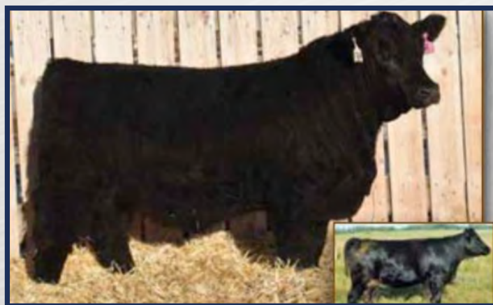
Circle G Explorer 40E

This is one of the most moderate and easy to look at sires in the herd bull pen which we purchased for $20,000. I'm sure he hasn't dropped an ounce of flesh since the day he got here, and that's pretty impressive in itself considering his depth and thickness. A very complete package that is eye appealing and to no surprise calved extremely well on heifers with EPDs in the 1st percentile for CE, BW and MCE. Spring Creek Simmentals bought a semen package and used him on heifers and mature cows and the resulting progeny are fantastic. We have just finished calving his first set of heifers, they are well balanced, feminine, moderate, young brood cows that all set up pretty udders with ample milk.