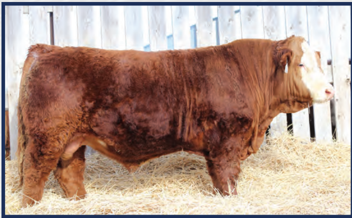
BJL MR KILLSWITCH 79F