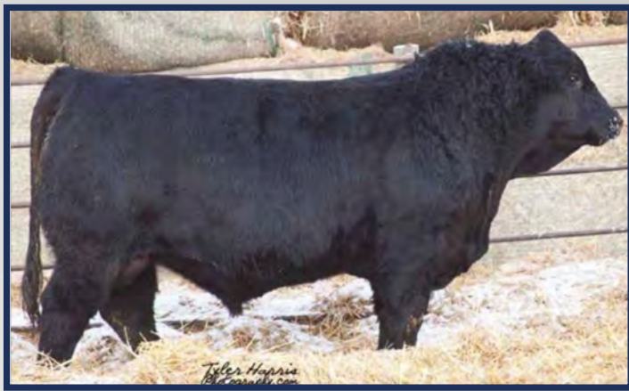
Muirheads Time Out 263B

110E has always been a standout and is as good as any bought bull we have ever brought West. Right from his first month up until now he has always displayed exceptional dimension and muscle pattern, as well as being extremely sound and free moving. His dam is productive and good uddered, with another calf in the sale this year and females retained in the herd. We believe you will find this set of calves to be performance oriented and built to last in the rugged conditions they were raised in, just like their sire.