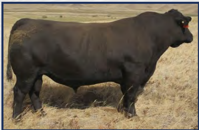
Shipwheel Chinook - Sire