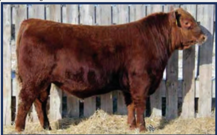
RED RSL UTAH 835F

Purchased from Moose Creek Red Angus, we didn't intend on spending over $20,000 for a heifer bull, but the good people at Triple S Angus definitely wanted him as well. This bull has added stoutness and style to each one of his calves and is still worth every penny.